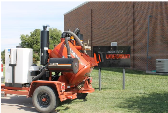
NEW FX20 Ditch Witch® Vacuum purchased by Kansas Institute of Underground Technology.